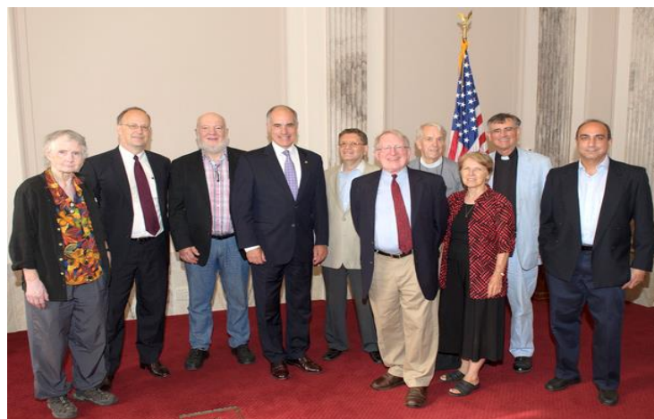
CFPA's Delegation for Iran Lobby Day to Washington, DC on July 23, 2015 meets with Sen. Bob Casey (D-PA)