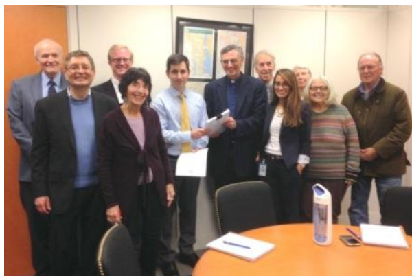
CFPA Nov. 20, 2014 meeting with Sen. Booker's Chief of Staff and Senior Foreign Policy Aide, to present petitions and advocate for the Iran Nuclear Agreement