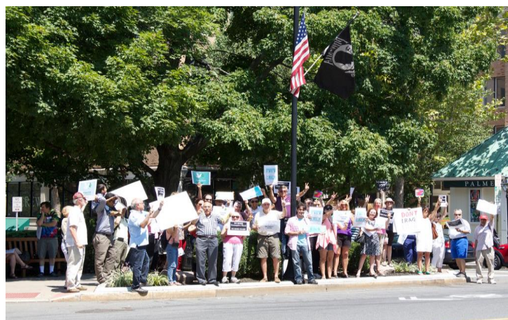
Emergency Vigil for Peace to Support the Iran Nuclear Agreement; "Global Day of Peace with Iran" August 15, 2015 Princeton, NJ