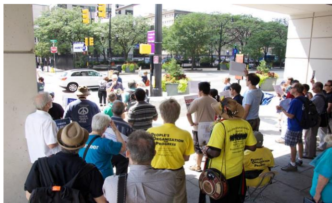
Emergency Demonstration outside of Sen. Cory Booker's Newark office urging his Support of the Iran Agreement August 29, 2015